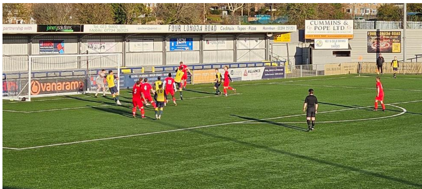
Action from Moneyfields Res v BW Dynamos at West Leigh Park