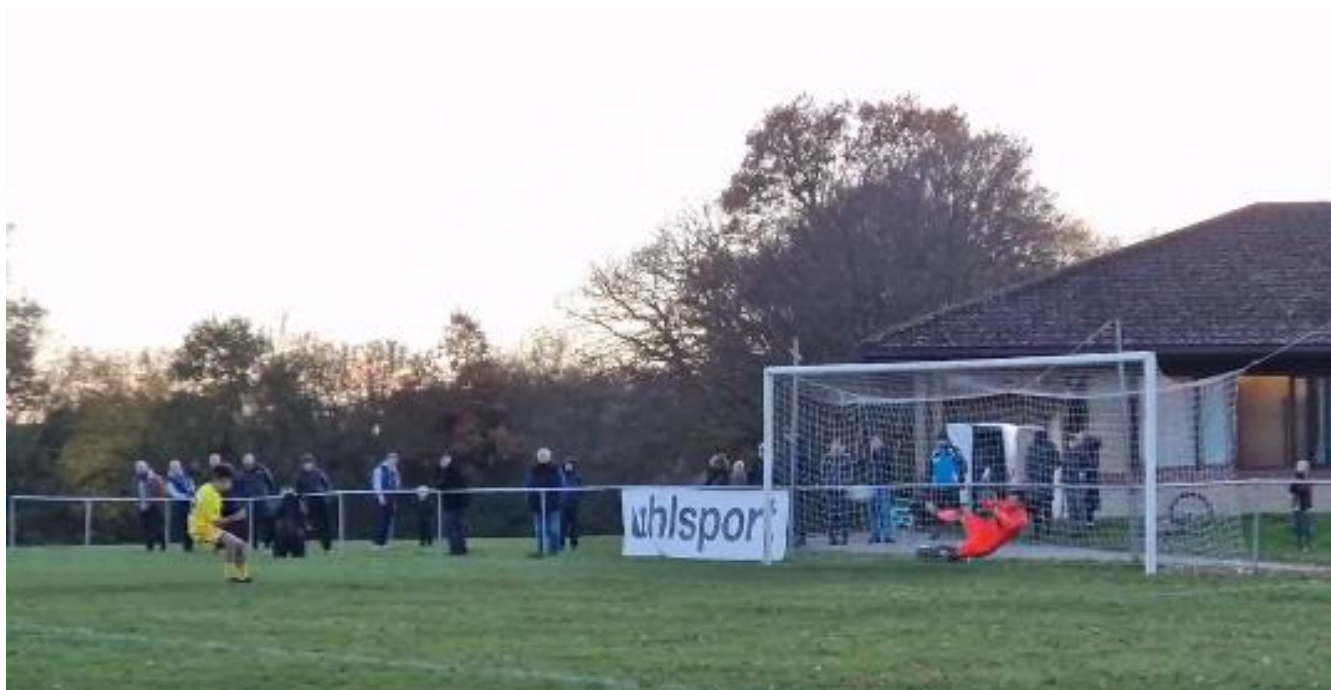
The crucial penalty save in the El Hedgio shootout...