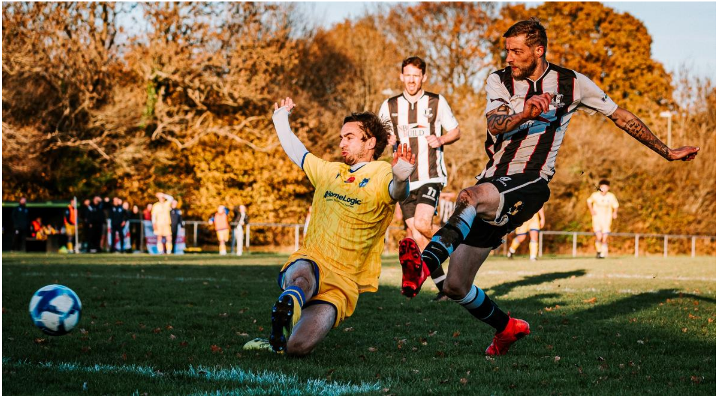
Action from Hedge End Rangers v Hedge End Town

uhlsport Hampshire Premier Football League 2023-24 Newsletter 17 24-25 Nov 2023