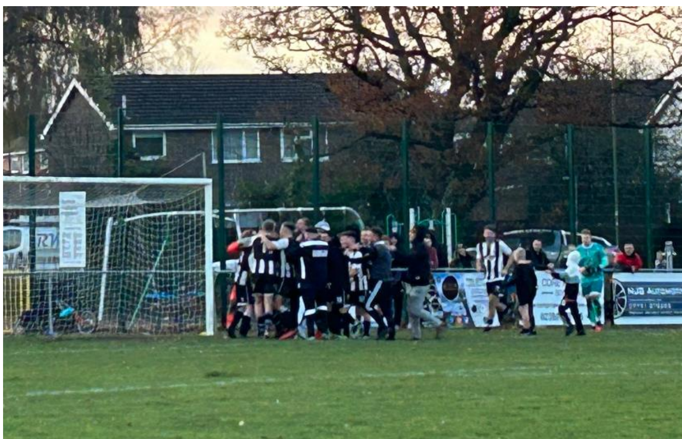
... and Hedge End Town celebrate their victory (with thanks to Terrace Traveller)